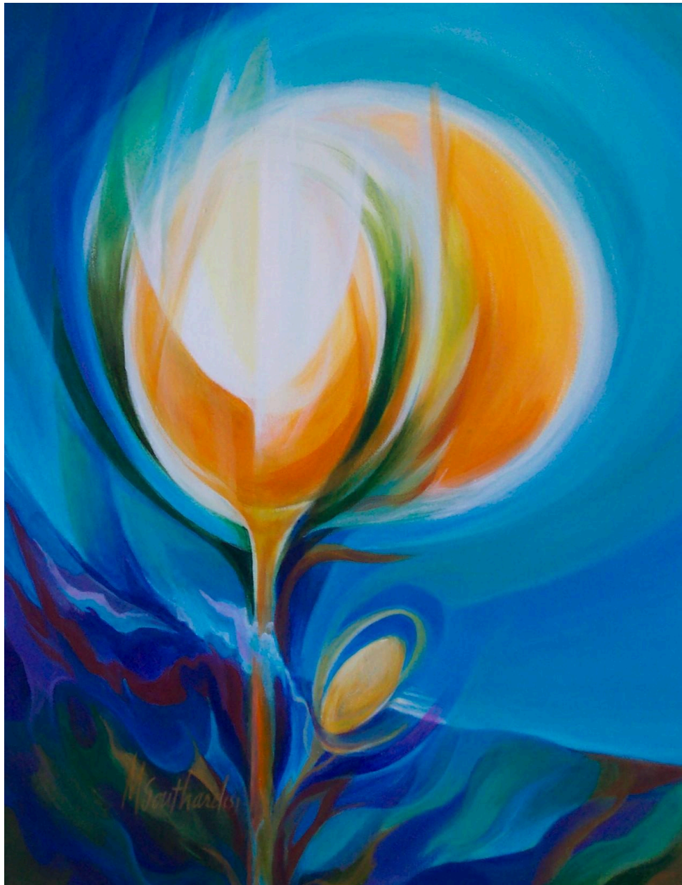
Artwork: Here Comes the Possible

First United Church of Christ, Northfield An Open and Affirming, Just Peace, Creation Justice, Immigrant-Welcoming Congregation